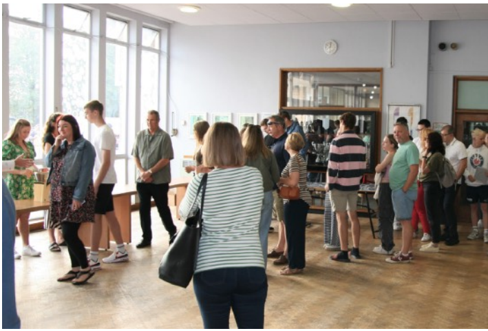
Anxious families awaiting their results

As our Year 11s move forward into their Sixth Form choices, whether here or elsewhere, we wish them all the very best of fortune. For those who decide to stay at BGS we can promise continued excellence as demonstrated by A-Level results last week.