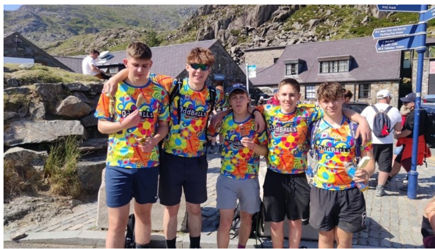
Shortly after reaching the base of Yr Wyddfa (Snowdon)