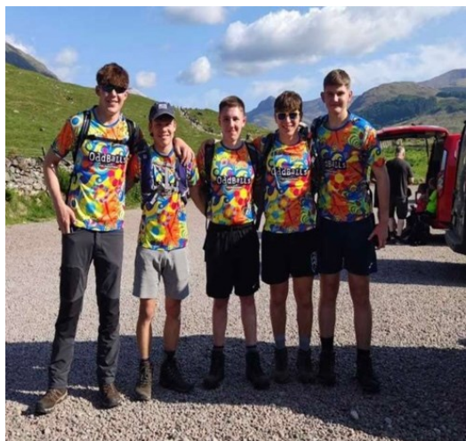
Minutes before we began Ben Nevis