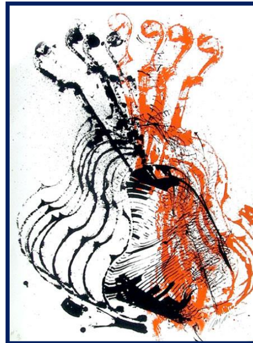
Arman 'Sans Titre 5' 1979

Have you referred to subject matter that reflects a sense of time passing, similar to momento mori?