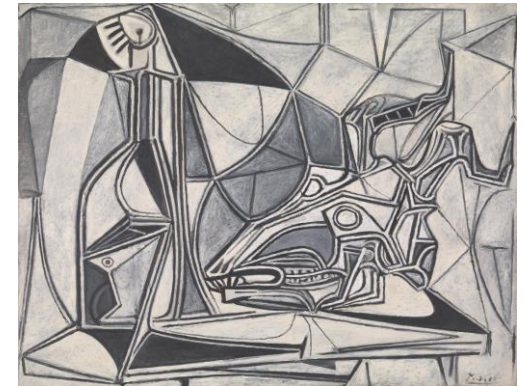
Pablo Picasso Goat's Skull, Bottle and Candle 1952