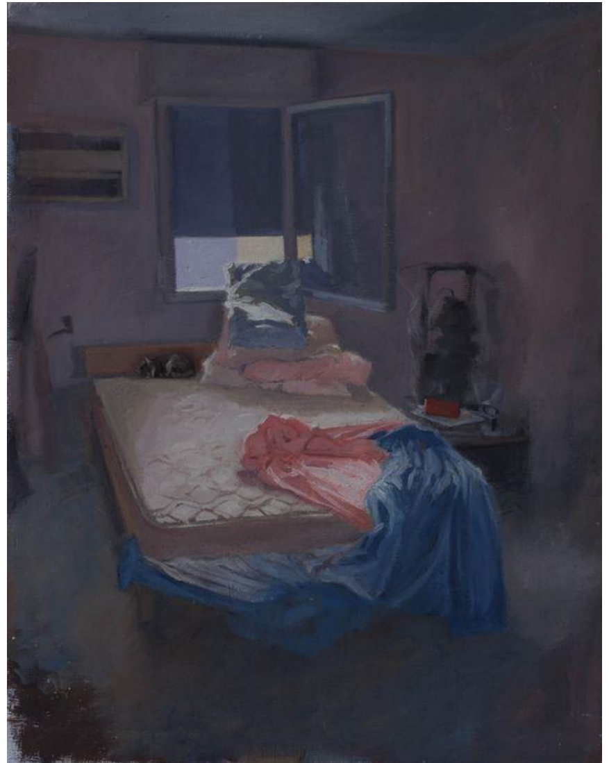
Misty Sundown in Pink and Blue, 2010

“The bedroom in our house is an endless source of inspiration for me, given the chasing light and movement of sheets, laundry and objects from day to day and from morning to night. I remember the first days that I was drawn to it for painting, and how when my fiancé returned home, he put some things away. I had to explain that he had just moved my “stillife.” Now I am not only used to it, I enjoy the changes, and have painted bedroom days on top of bedrooms days as a possibly truer way of painting the “reality” of the bedroom, and my life. When I paint these, I think of them as landscapes, looking at the sheets, pillows, window, laundry and other objects as if they were hills, mountains, sky or earth. The peek out the window provides a second dimension to the viewing experience, reminding me that I am inside after all.”