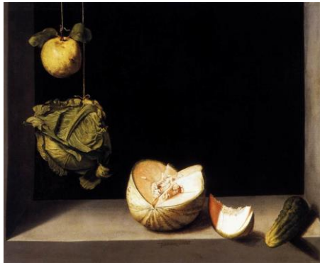
Juan Sánchez Cotán Still Life with Quince, Cabbage, Melon and Cucumber 1602

We want you to produce an ambitious set of work that explores the theme through the genre (subject type) of Still Life . You'll need to create your own resources using photography and research artists whose work could inspire you . We'd like you to produce a collection of work showing a personal response to the topic.