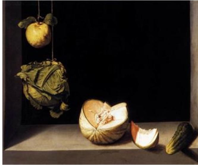
Juan Sánchez Cotán, Still Life with Quince, Cabbage, Melon and Cucumber 1602

Still Life has changed over the centuries. Artists have used the genre to symbolise life and death, wealth, new beginnings, hope, intelligence and beauty. Today, Still Life has been explored by a variety of contemporary artists, who are trying to change its meaning and importance in the world of Art. They are using new forms of display to project their ideas, whilst referring back to a more traditional sense of the term.