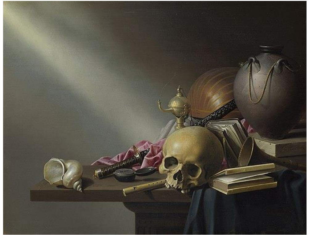
Herman Steenwyck, The Vanities of Human Life , 1645

Find out about Steenwyck's painting to understand how each part showed symbolism relating to the time.