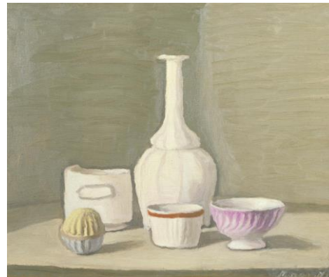
Georgio Morandi Still Life 1946