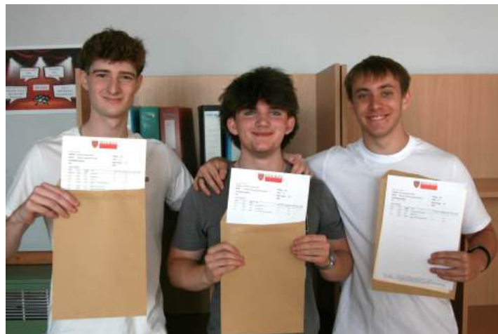
2025 A-Level Results Day